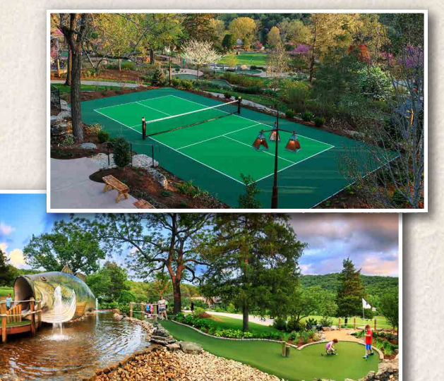
*Check out our events calendar online for more seasonal offerings (<u>bigcedar.com/events</u>)